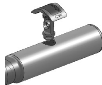
On-site calibration device

The CEL-712 Microdust Pro can be used for spot checks and walk through surveys with the advantage of seeing instantly when and where excessive dust levels are occurring. The CEL-712 Microdust Pro is very easy to use with a simple interface. A user can be taking a measurement within seconds of starting the unit. A calibration filter is used on site that provides a spot check of the linearity. This is unique to the market as no other device has this capability. The screens are colour coded to ease navigation, once a measurement is started they turn green (shown right) or red when stopped. When taking a measurement, real-time averages and instantaneous levels are shown and subsequently stored to the memory for review later.