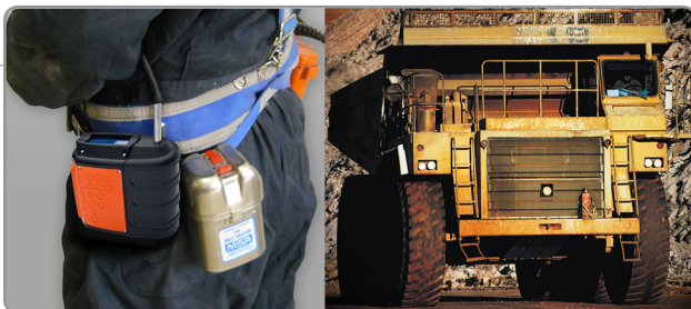
Lightweight and wearable on a belt loop or can be mounted on a vehicle or wall

Includes Airtec monitor, inlet prefilter assembly, five filter cassettes, two prefilter cartridges, USB to mini-USB PC cable, rechargeable battery with 9V/2A Universal AC adaptor (100-240VAC)